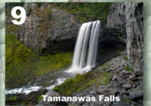
9 Tamanawas Falls