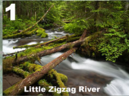
1 Little Zigzag River