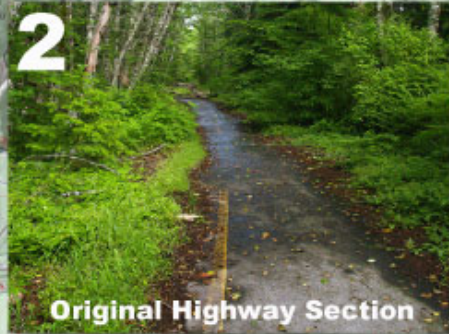
2 Original Highway Section