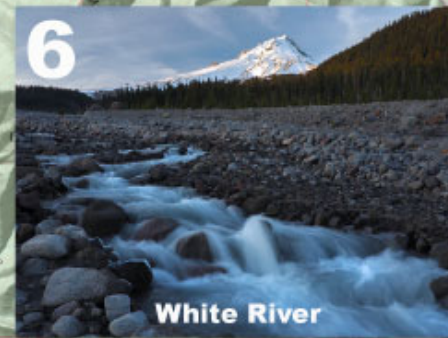
6 White River