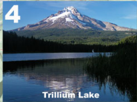
4 Trillium Lake