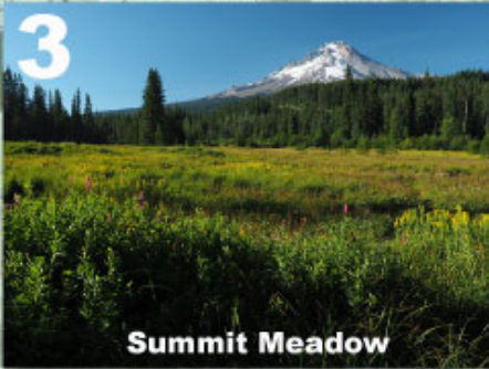
3 Summit Meadow