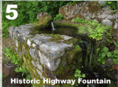
5 Historic Highway Fountain

Trail Distance from Rhododendron to Sherwood Campground: 33 miles