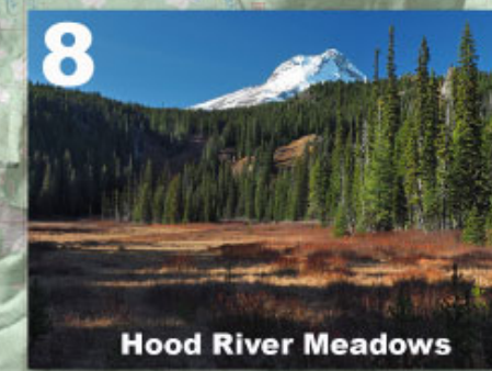
8 Hood River Meadows